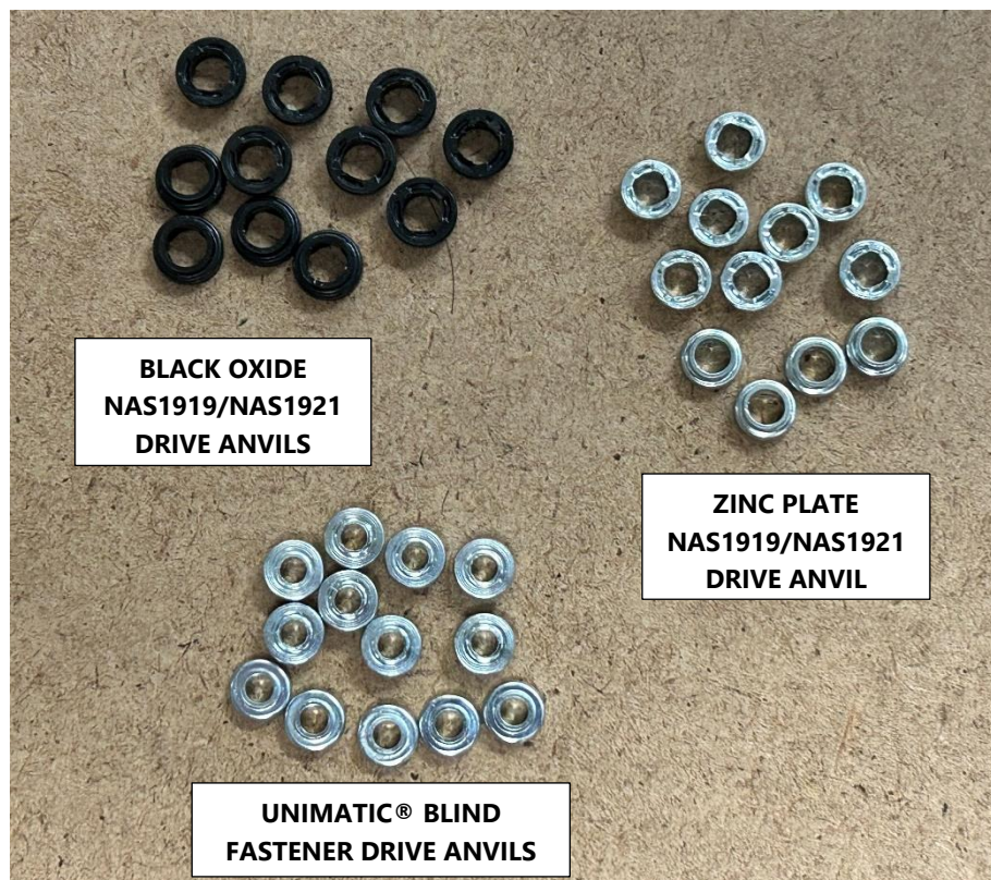
DRIVE ANVILS, NAS1919/NAS1921 & UNIMATIC® BLIND FASTENER